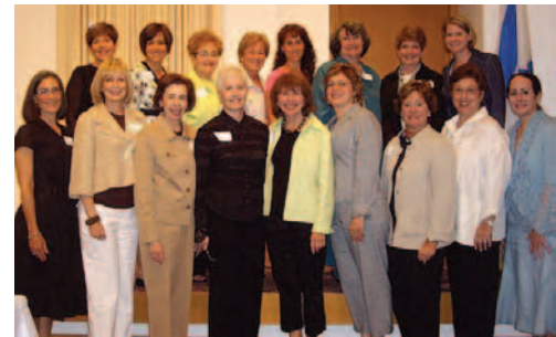
Past, Current, and future NCJW presidents at the Spring meeting, installation and benefit.