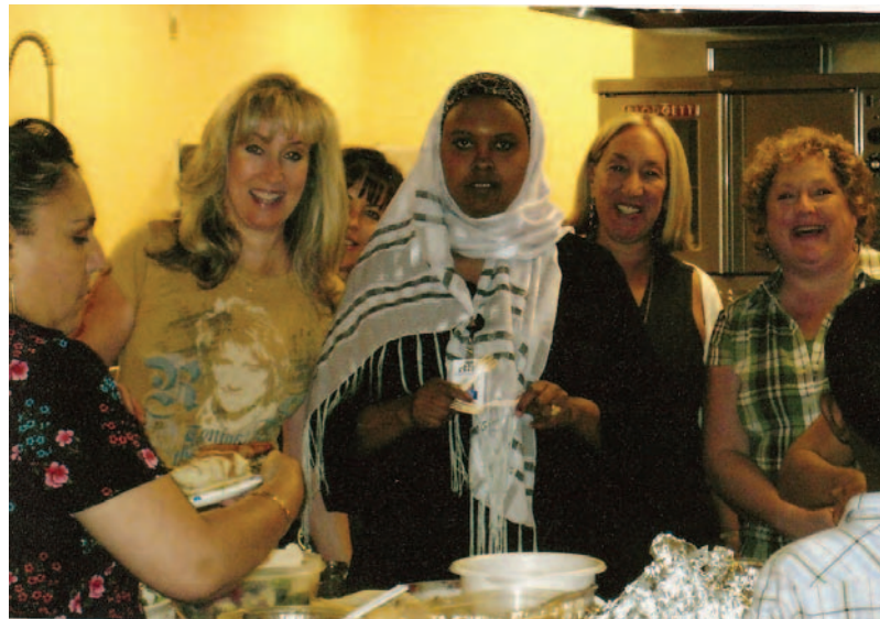
NCJW volunteers, Neighborhood House Staff and Neighborhood TakeOut participants learn a new recipe.

In the spirit of improving the ease of section communications and reducing waste, please send a message with your name and email address to info@ncjwstpaul.org . Email addresses will be used to notify you of NCJW activities and events.